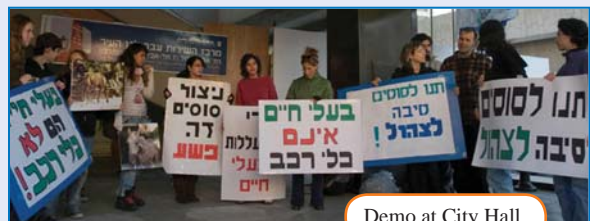
Demo at City Hall